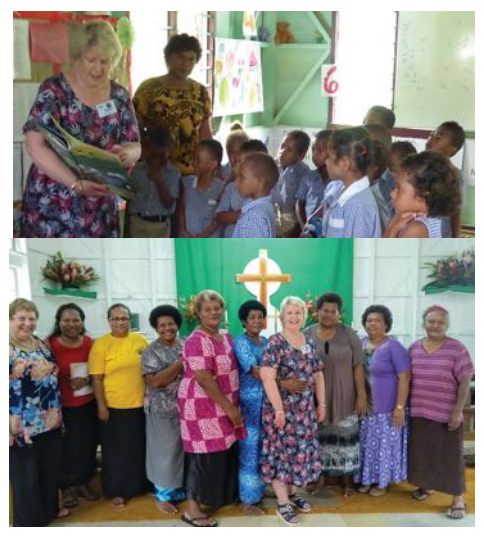
Above: St John's, Wailoku, Suva -School and Kindergarten, Church

It was a wonderful experience and a highlight of my term of office. Our thanks go to the members of the Polynesian Executive for the comprehensive programme and most of all for being wonderful and generous hosts.